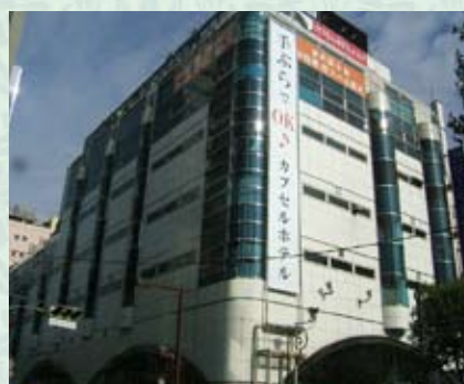
5 Green plaza Shinjuku