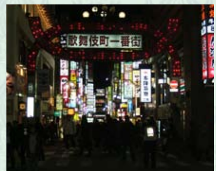
3 Kabukicho-ichibangai entrance