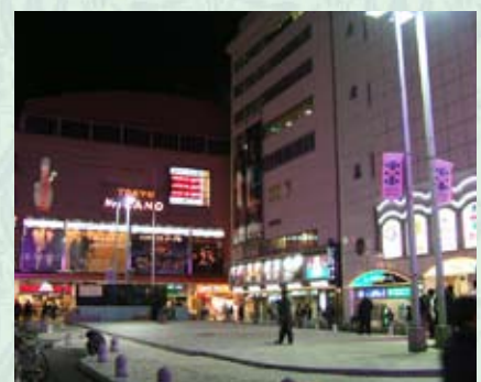
6 Cine city square