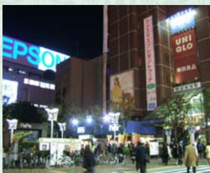
4 Seibu Shinjuku station