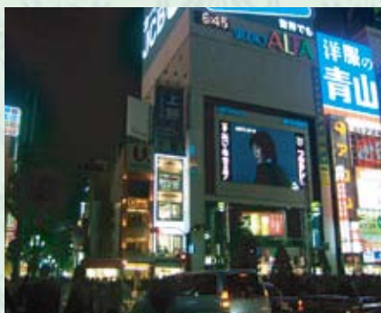
1 Studio Alta

5 minutes walk from JR line "Shinjuku" station, right in front of "Seibu Shinjuku" station.