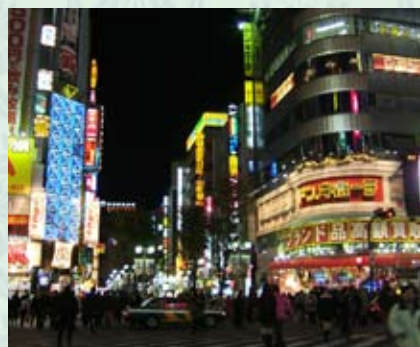
2 Kabukicho-main street entrance