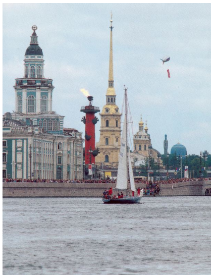
The Peter and Paul Fortress