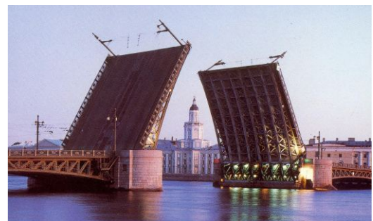
The Palace Bridge and Kunstkammer

For High School graduates who usually get their diplomas about June 21-22. From late May to early July nights are bright in St Petersburg, but the real White Nights normally last from June 11 to July 2. The nature of the White Nights (Beliye Nochi) can be explained by the geographical location of St. Petersburg. It is the world's most northern city with a population over 1 million. St Petersburg is located at 59 degrees 57' North (roughly on the same latitude as Oslo, Norway, the southern tip of Greenland and Seward, Alaska). Due to such a high latitude the sun does not go under the horizon deep enough for the sky to get dark. The dusk meets the dawn and it is so bright that in summer they do not turn street lighting on.