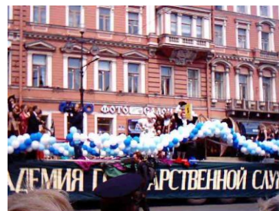
The Costume Show

It is held in the beginning of June. The program includes Theatre Characters' Parade, Life Pictures, Episodes from Theatre Plays. The shows will take place in the Arts Square, Theatre Square, Mohovaya Street, Summer Garden and near the Engineers' Castle. There will be Festival shows in most of the music and night clubs of St.Petersburg. Specially organised groups of people from all districts of the city as well as the delegations from foreign countries will take place in the Festival. You'll see the Parade of specially designed platforms of the biggest companies of St.Petersburg and Moscow, various state organisations and educational institutions.