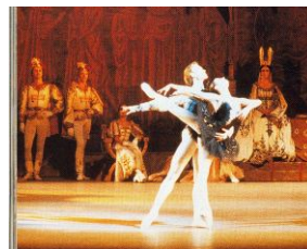
The Mariinsky Ballet

This Festival has become famous all over the world. Since 1993 it has become the event where the artistic aims of the performers met the demands of the artistic interests of the audience. The beauty of the White Nights, sung by Pushkin, creates the unique atmosphere of the Festival, where we can watch the brilliant acting of the best Russian and foreign actors and actresses. You can watch and listen to the masterpieces of the Russian and European composers: Tchaikovsky, Beethoven, Berlioz, Mozart, etc. Modern music is also presented at the Festival. Some musical fragments will be presented to the public for the first time in Russia.